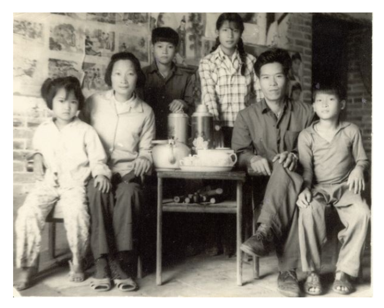
My first family picture taken in 1983. I'm the boy standing in the back.