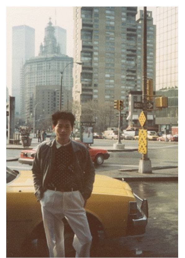
New York City. I spoke no English when I came to America.