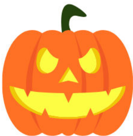
jack O' Lentern