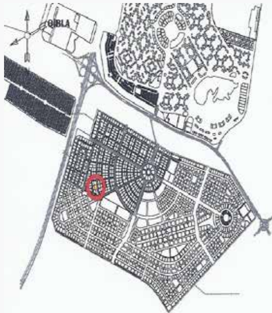
INTERNATIONAL CITY PHASE 3