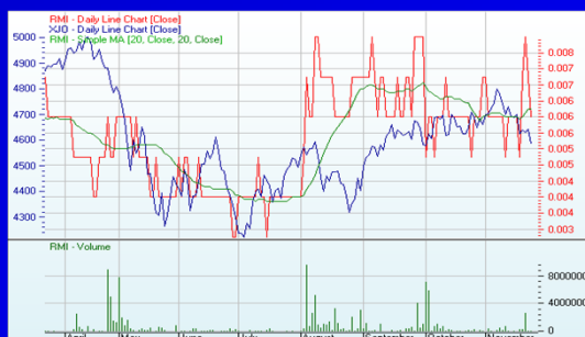
RMC price history chart