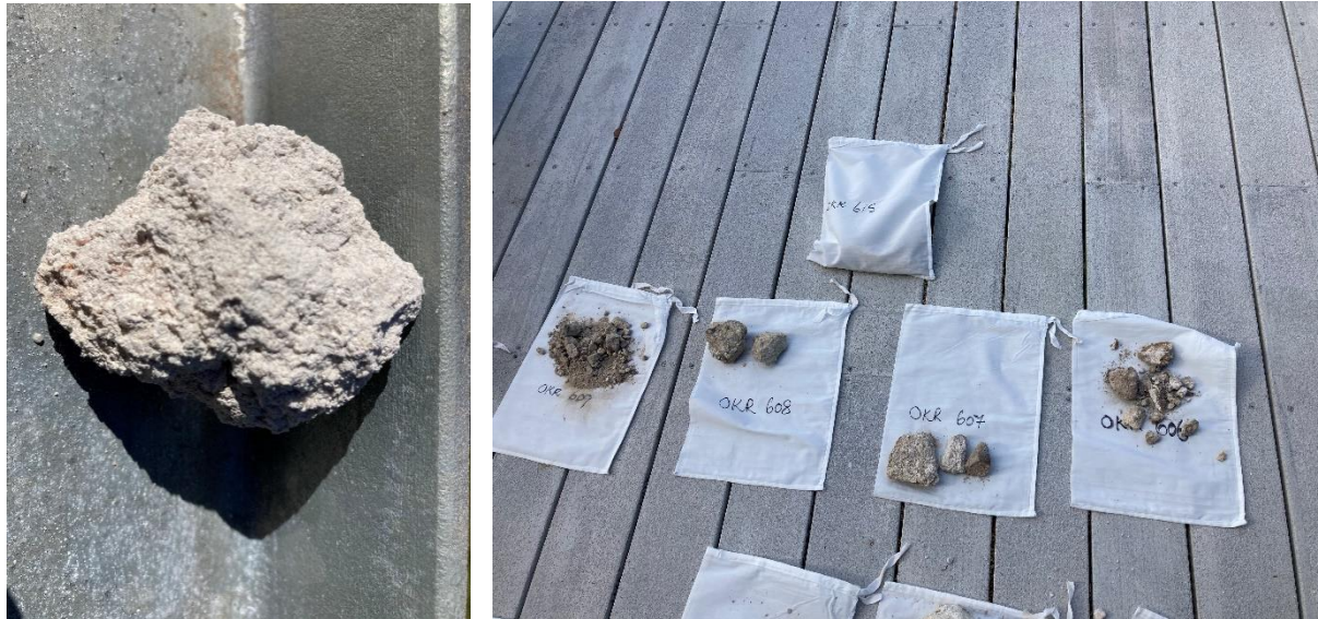
Figure 2 & 3: Samples collected for testing from this week's site visit