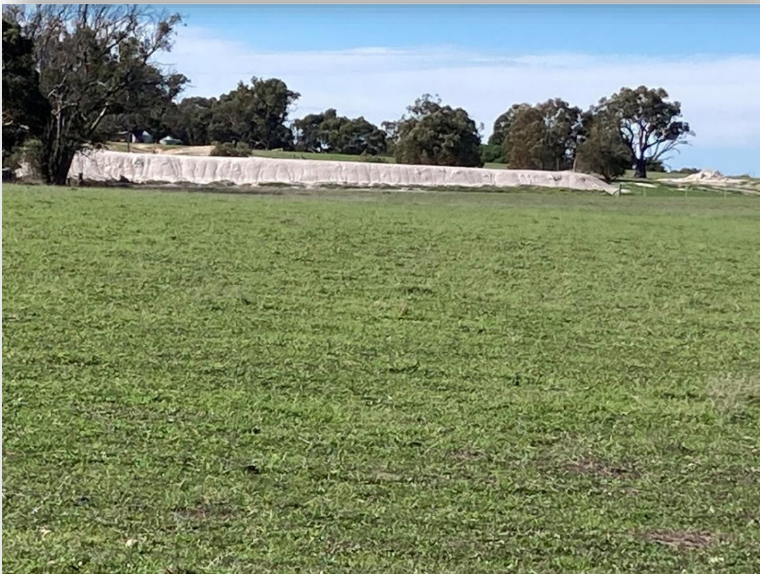
Figure 5 & 6: Typical feed stock dams located throughout the project area, highlighting kaolin material present