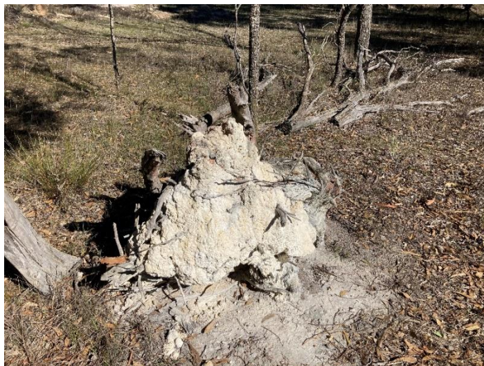
Figure 4: Outcropping Kaolin at surface in Holly Kaolin Project Area