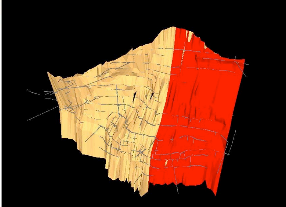
Figure 2 - Oblique view of the Maria Vein wireframe with historic drives shown in grey, the Dubbo Zone is shown in red. This is the pre-mined model, historic depletions were subtracted from this model.