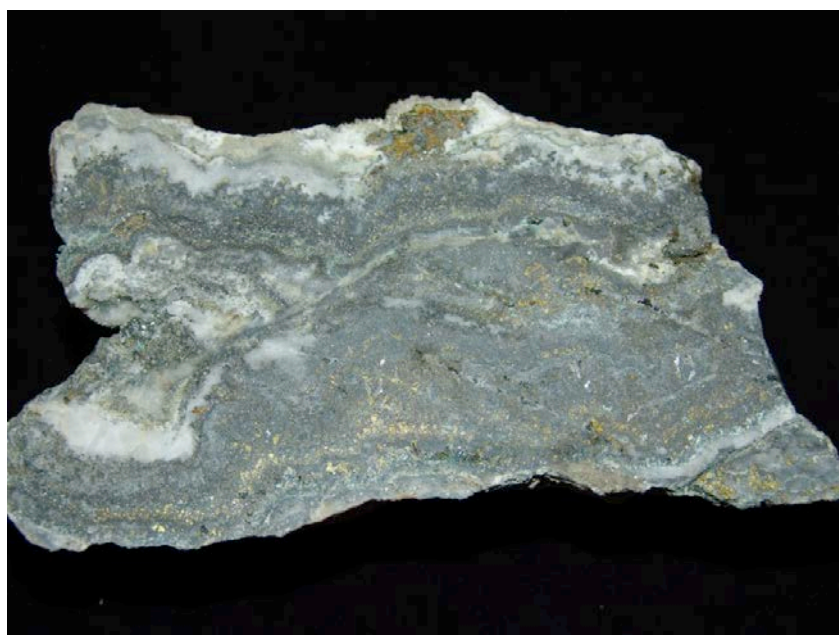
Figure 4 - Sample taken from Talisman Deeps areas - currently stored at Auckland museum

A lower cut-off grade of 3.0g/t Au Eq (previously 0g/t) was applied to reflect the mine cut-off grade estimated for the financial modelling in the 2013 prefeasibility study. No top cut to the data was applied.