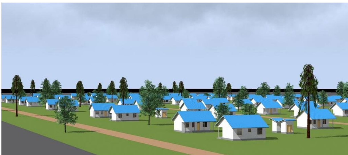
Figure 1: Computer generated diagram of Eco-Village