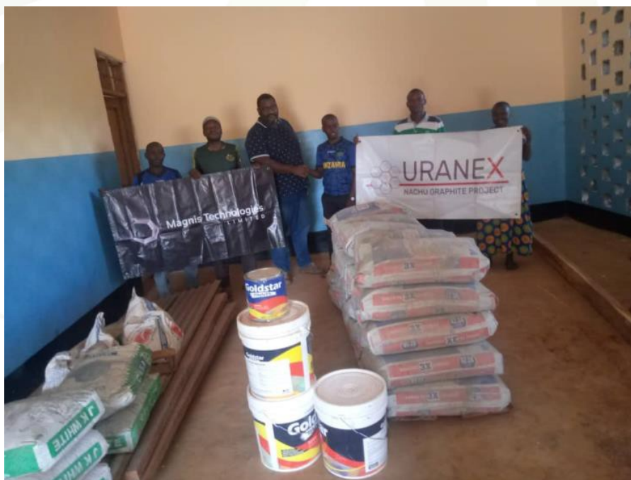
Figure 3: Building supplies provided to Mihewe Medical Clinic