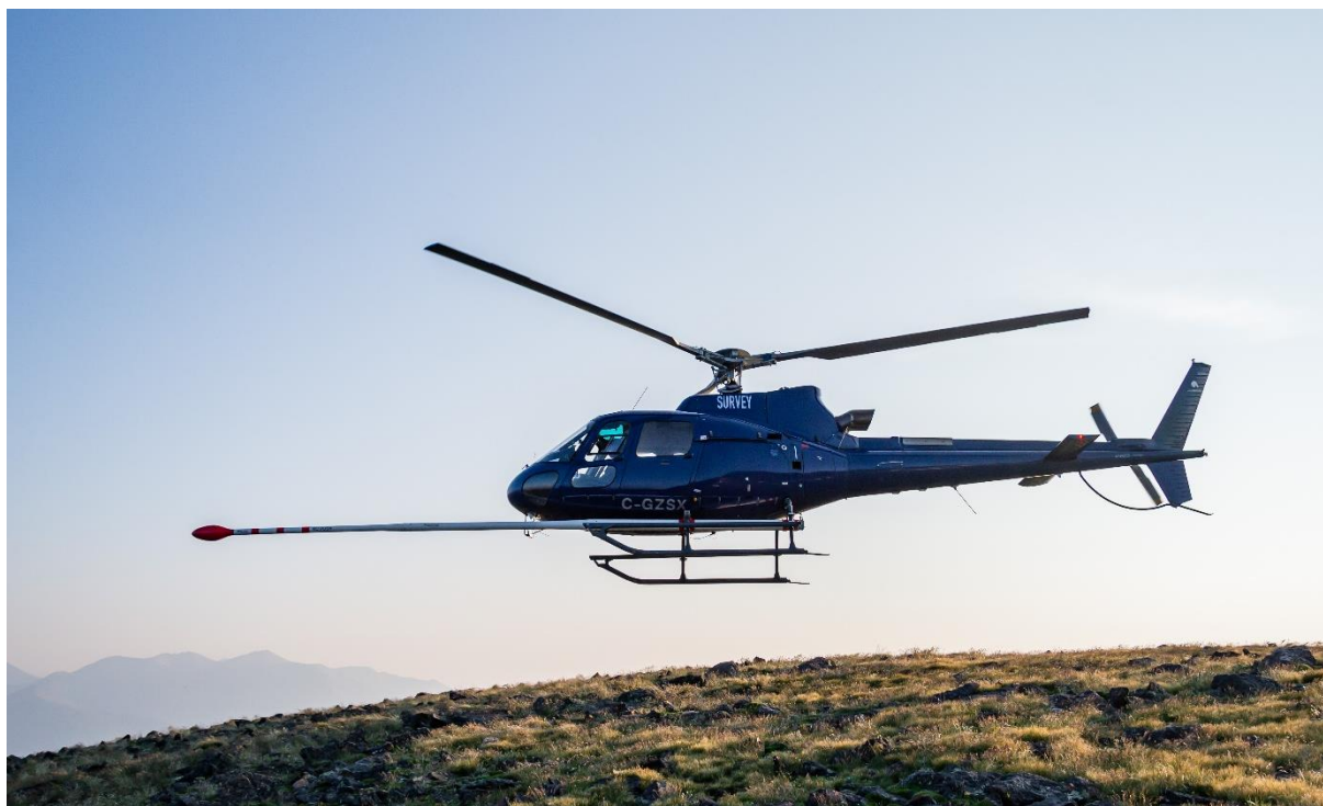
Figure 1; Photo of Eurocopter AS-350 B3 with magnetometer probe being utilised at Locksley's Mojave Project.