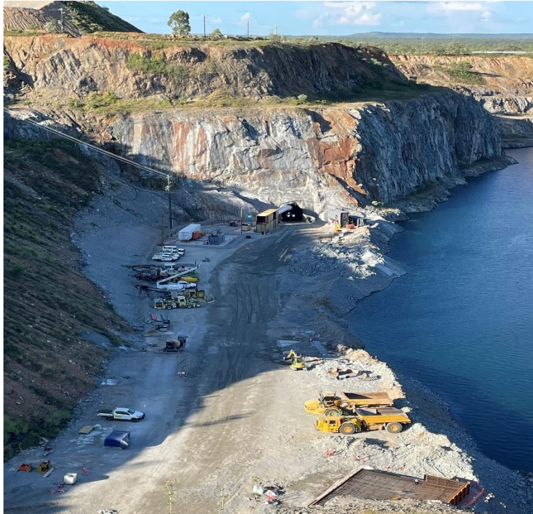
Figure 1: MAT Portal Area