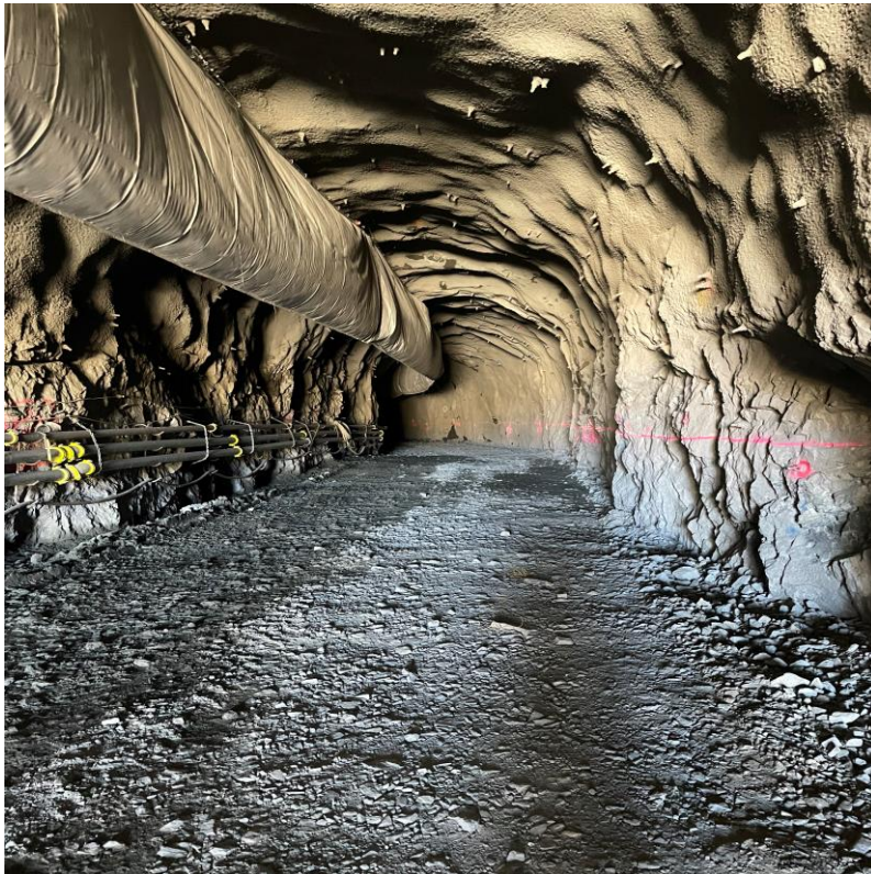
Figure 3: MAT (looking from Portal to first bend)

This announcement was approved by the Board of Genex Power Limited.