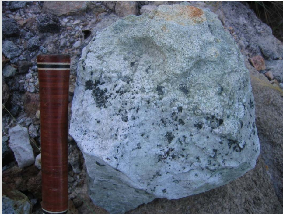
Figure 3: Greisenised rock sample from Manga, April 2007