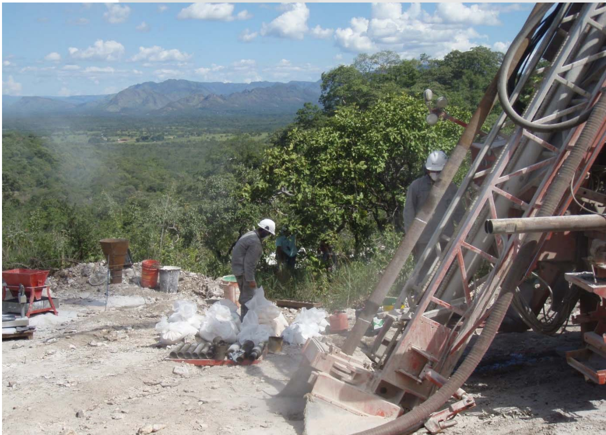
Figure 2: Reverse Circulation drilling at the Manga Prospect – April 2008