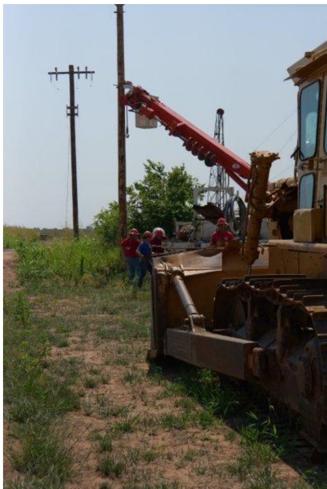
Figure 1 – Powerline Construction at Production Hub 2

AOK will update shareholders on its drilling program in Oklahoma and Kansas in the coming weeks and the status of well completion activities at Snake River.