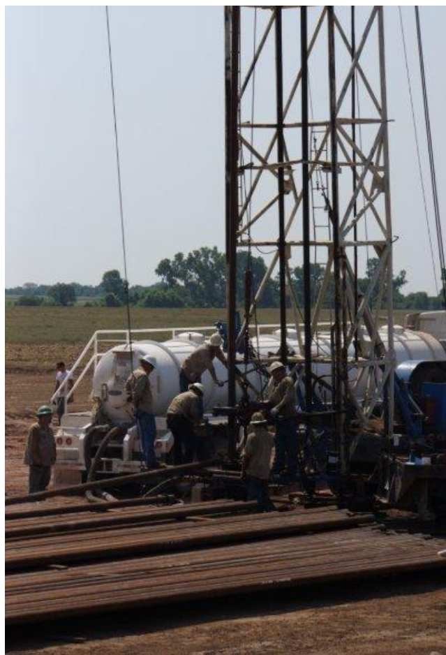
Figure 2 – Tubing being run into Blubaugh #20-1 SWD