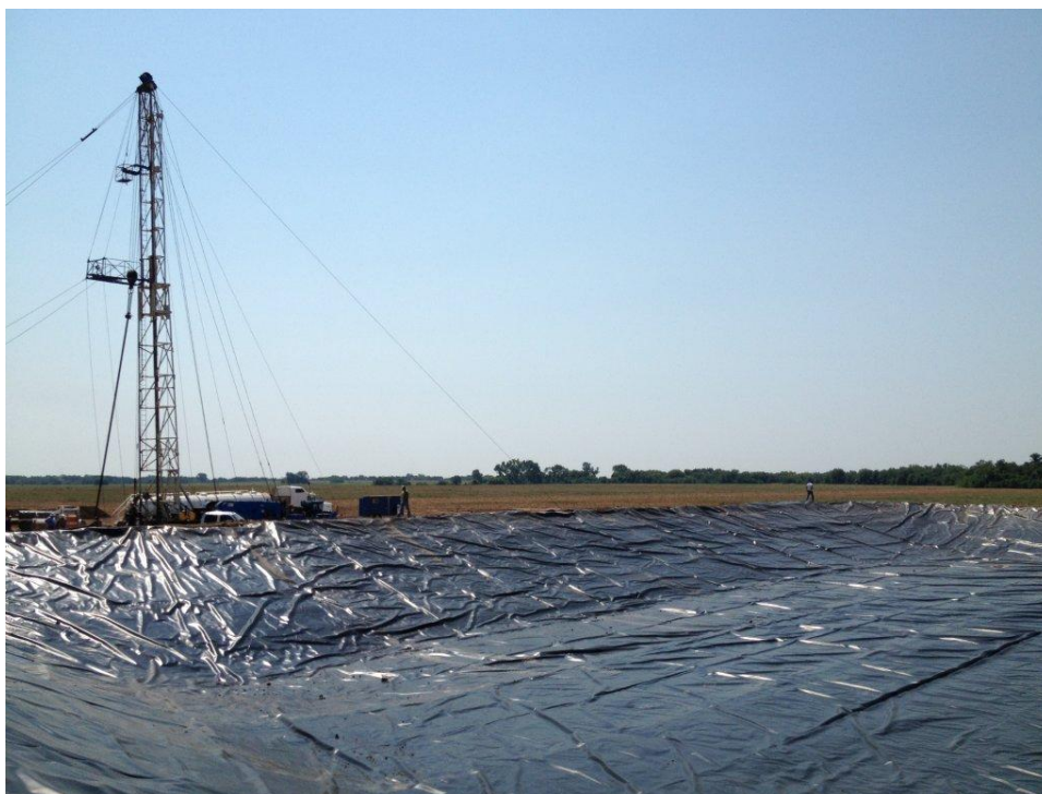
Figure 3:- Frac pond construction on Production Hub 2