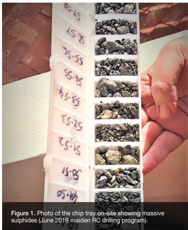
Figure 1. Photo of the chip tray on-site showing massive sulphides (June 2019 maiden RC drilling program).

"I am pleased to announce that Cobre has discovered a VMS deposit within its Perrinvale Project area in the Panhandle Greenstone Belt of Western Australia. Discovering a high-grade VMS system enriched in copper, gold, silver and zinc from our maiden drill program is a credit to our technical & exploration teams. The mineralisation is open to the NNW and possibly down dip. More broadly, the potential exists for an extended VMS system across a large proportion of our tenements. High-grade VMS systems are very rare globally, with the last significant deposit in Australia discovered more than a decade ago by Sandfire Resources (SFR.AX)."