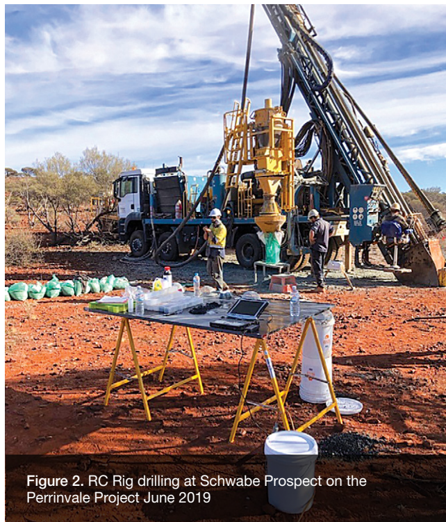
Figure 2. RC Rig drilling at Schwabe Prospect on the Perrinvale Project June 2019

of the project area thought to be favourable for VMS. This analysis identified 8 widely-spaced conductors up to 3km long which could be associated with VMS mineralisation (see dotted lines on figure 3).