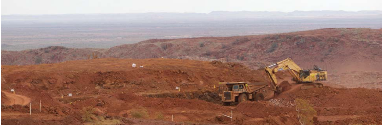
First mining at the Anson Deposit, Wodgina

In June 2010 mining started at Atlas' Wodgina DSO Project, located 110 kilometres south of Port Hedland in the Pilbara of Western Australia (see Atlas announcements dated 30 April and 21 June 2010). With the commencement of mining at Wodgina and the scheduled delivery of the new multi-user port at Utah on 17 September, Atlas is on track to more than quadruple combined Pilbara iron ore exports to 6Mtpa rate by December 2010.