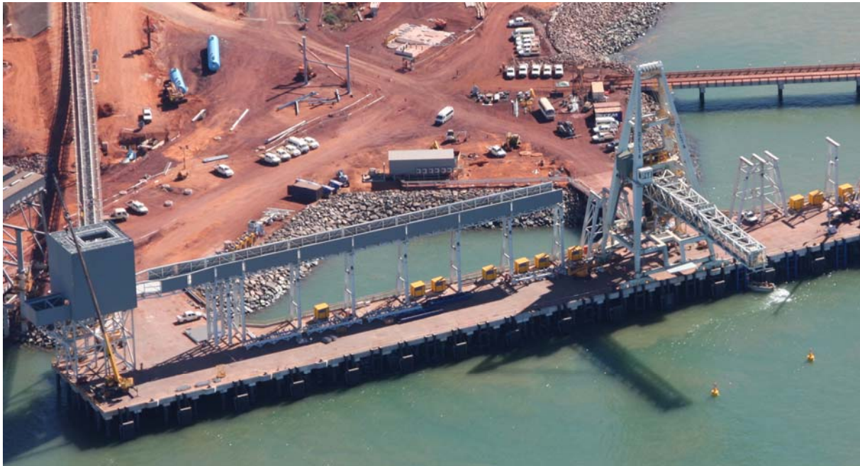
Utah Point Multi User Berth (with locally constructed 7,500 tonne/hr ship loader in place)