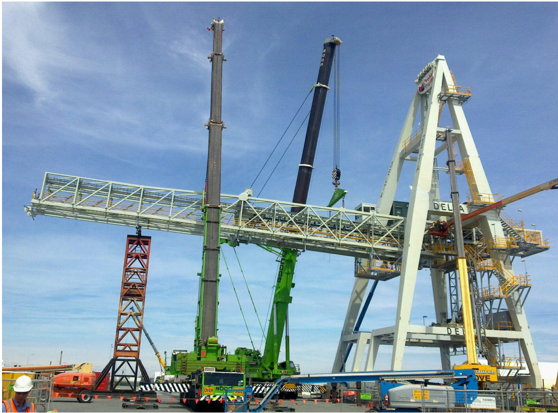
Figure 4: Utah Point Port ship loader erect