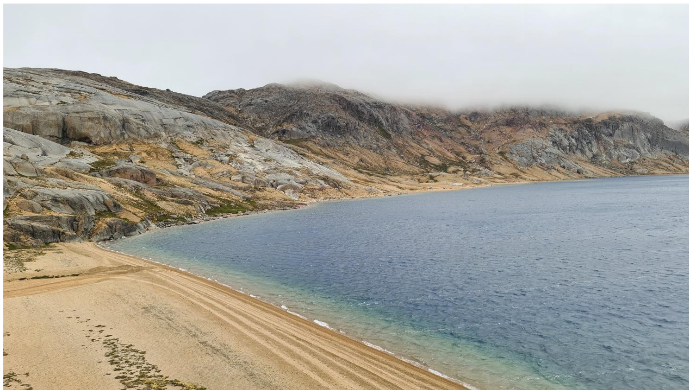
Figure 1. Southern Beach at the Blue Lagoon project.

Mineralisation shows enrichment within finer grain-size fractions, indicating potential for natural upgrading and supporting future beneficiation pathways.