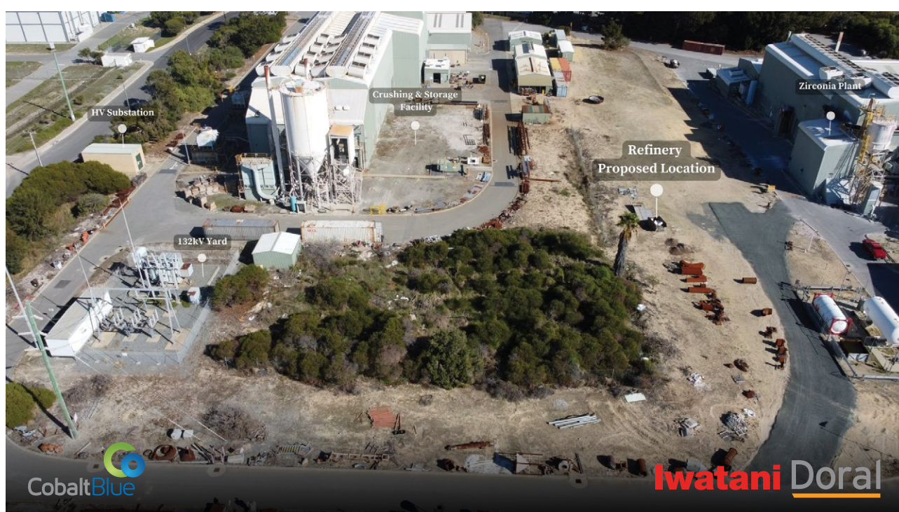
Figure 2 – Proposed refinery site adjacent to Iwatani (Doral Fused Material) operation

Detailed engineering design for the Refinery has commenced and the permitting process remains on schedule for submission by mid-2024. With all workstreams progressing according to schedule, a decision to proceed with construction is anticipated by September this year. See here for the latest update on the Refinery's development progress.